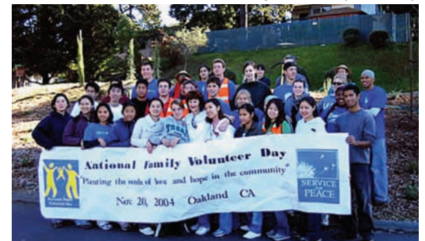
Planting - National Family Volunteer Day